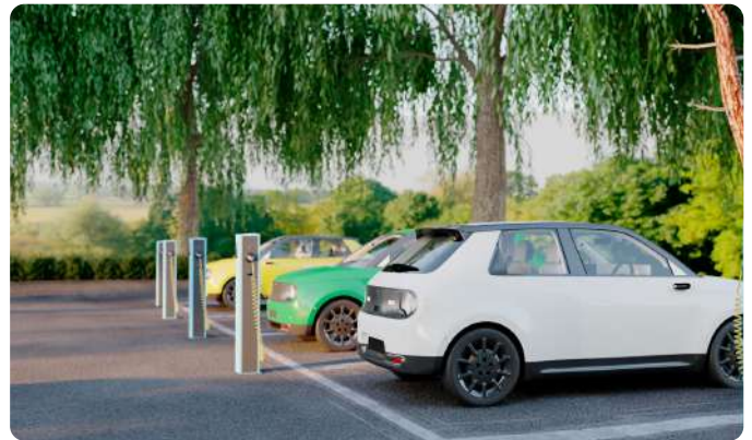
Driving the Future of EV Maintenance with On-Board Diagnostics