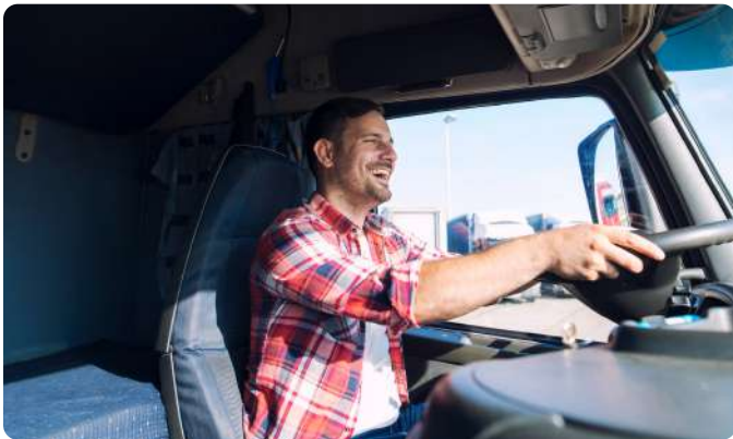
Driving Business Efficiency with On-board Diagnostics for Rentals